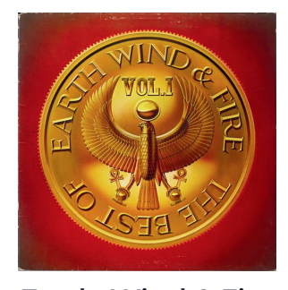
Earth, Wind & Fire