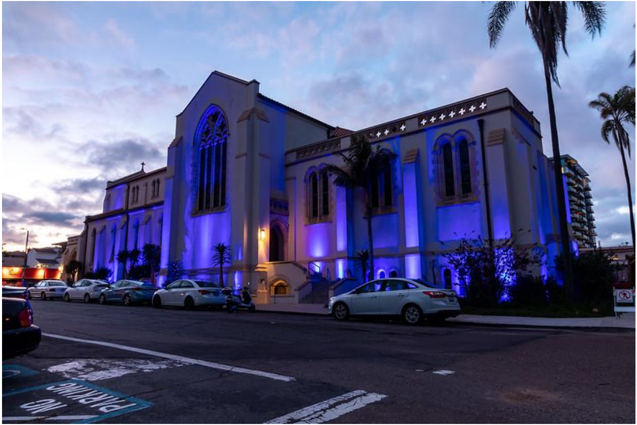
St. Paul's Cathedral lit up blue to honor Healthcare Workers in April of 2020.